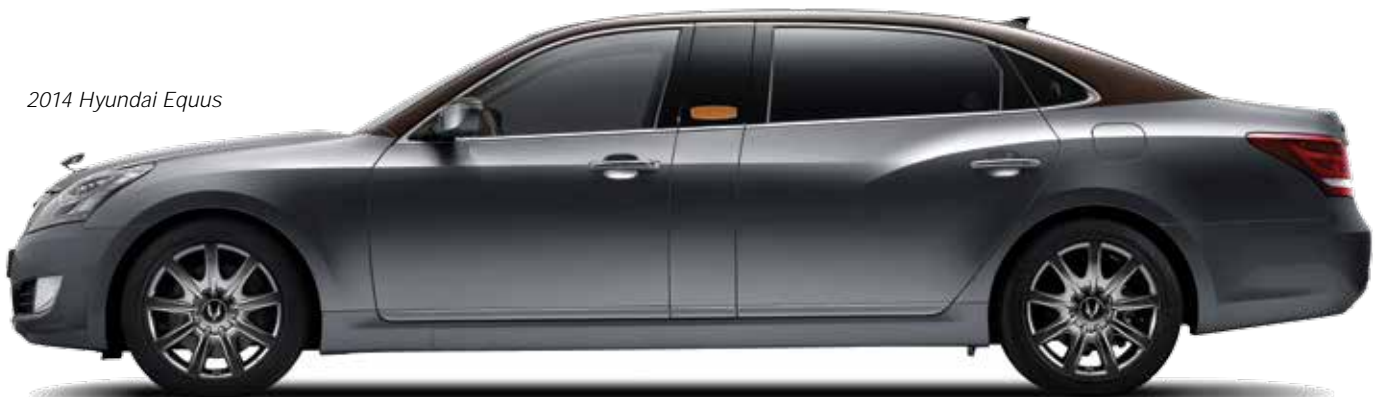
2014 Hyundai Equus