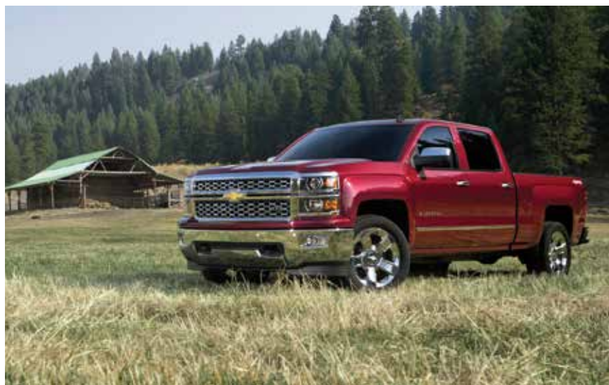
STRATTEC adds keys for 2014 Chevrolet Silverado