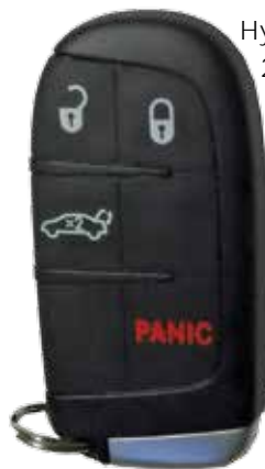
Advanced Diagnostics software will program Dodge 2013 proximity/Fobik key & remotes

ADS196 software will program proximity and basic keys for the bladed keys for the Kia Rio 2012 onwards and proximity keys for Hyundai Elantra 2011 onwards,