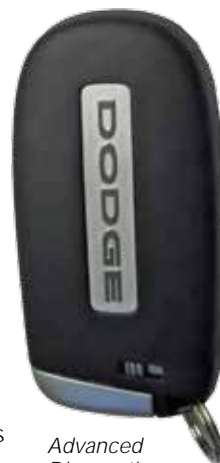
Advanced Diagnostics Dodge Dart remote, back side

Specific models of the 2013 Ford Escape are available with Intelligent Access with push-button start. These vehicles are equipped with a