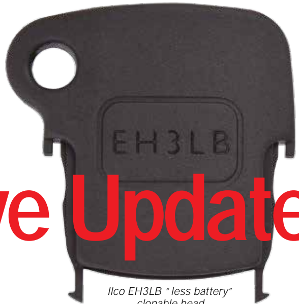
Ilco EH3LB "less battery" clonable head