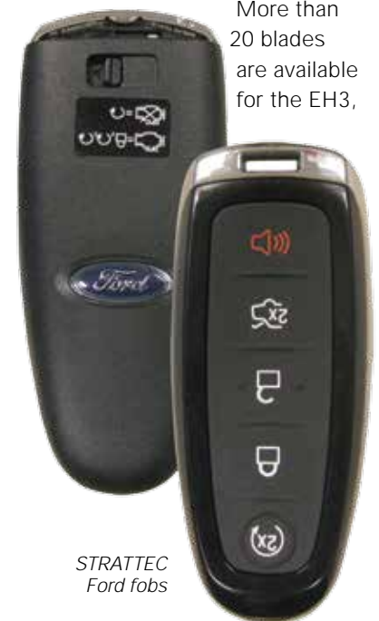
STRATTEC Ford fobs

More than 20 blades are available for the EH3,