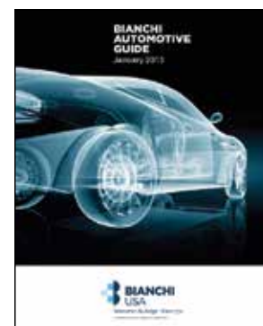
Bianchi 2013 Auto Guide

For more information, contact your local locksmith distributor or www.bianchi1770usa.com .